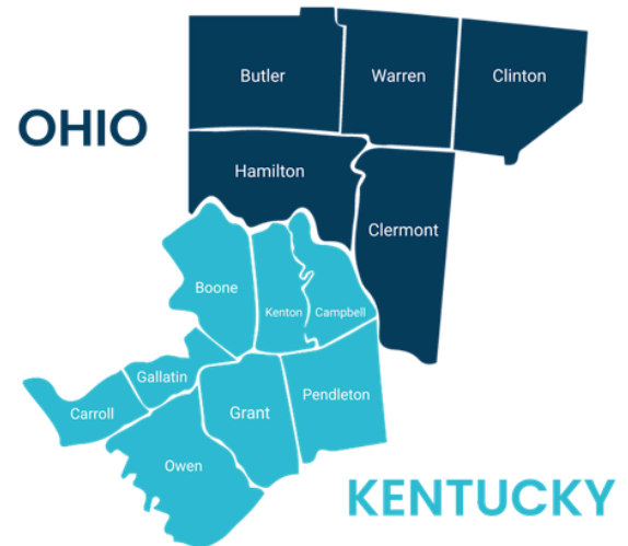
Meals on Wheels of Southwest OH & Northern KY service area