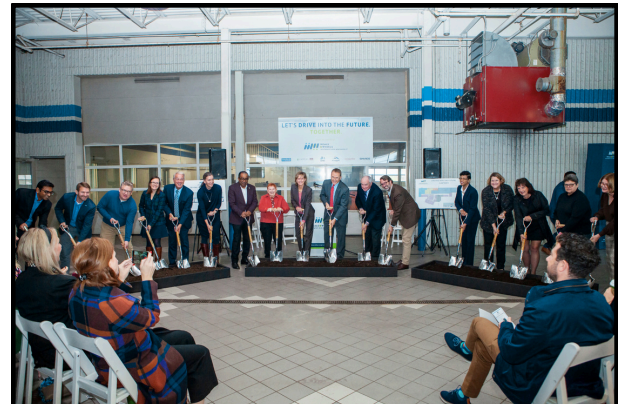
Meals on Wheels leadership, "Driving Into the Future Campaign" leadership, community partners, corporate partners and campaign supporters and more broke ground in October 2025.