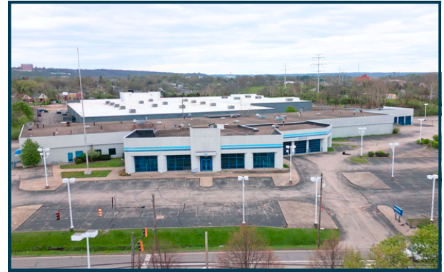
At 3251 Highland Ave., this location is accessible via Cincinnati Metro bus lines and provides easy access to I-71 and I-75.